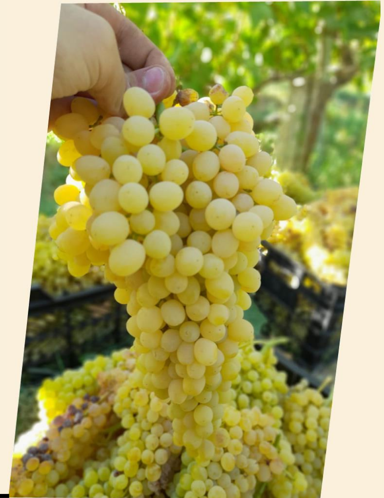
Malayeri Seedless Grape