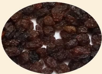
Dark Brown(Sun-dried) Raisins

Raisin, also known as Kismis or Kishmish , is a soft and sweet dried grape that contains essential nutrients and health benefits. There are many types of raisins in the world market. In the Malayer (west of Iran), the raisin is produced from the unique seedless grape with suitable properties for raisin making. The Malayeri Seedless grape is similar to the Thompson seedless variety. Grape Production System in Malayer has been formally recognized as a Globally Important Agricultural Heritage System (GIAHS) by the Food and Agriculture Organization of the United Nations (FAO) since 2018. Based on drying method, three types of raisins are made by Malayeri seedless grapes: Dark Brown , Light Brown and Golden .