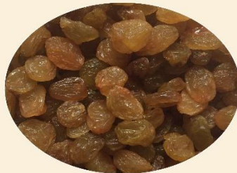
Light Brown(Sultana) Raisins